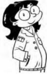
wearing Monica is jacket purple a