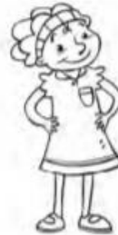
dress Ruby's yellow is