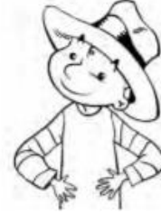
hat is pink Robby a wearing